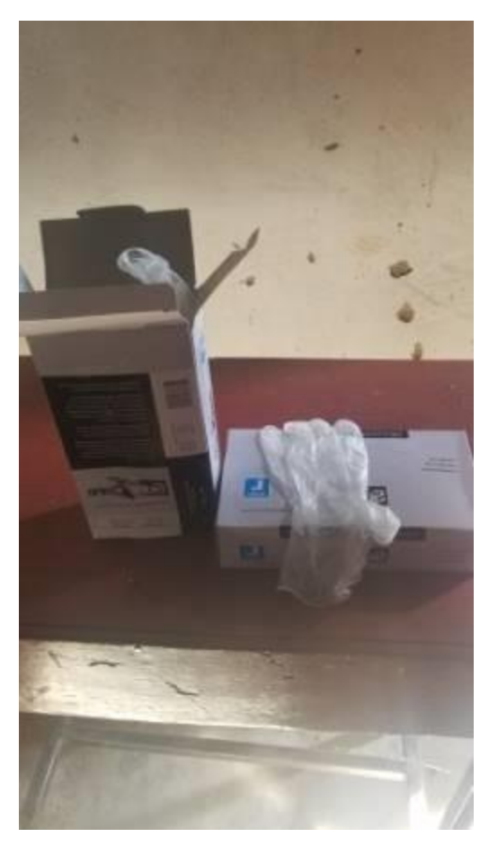
5 - Cartons of sanitary gloves