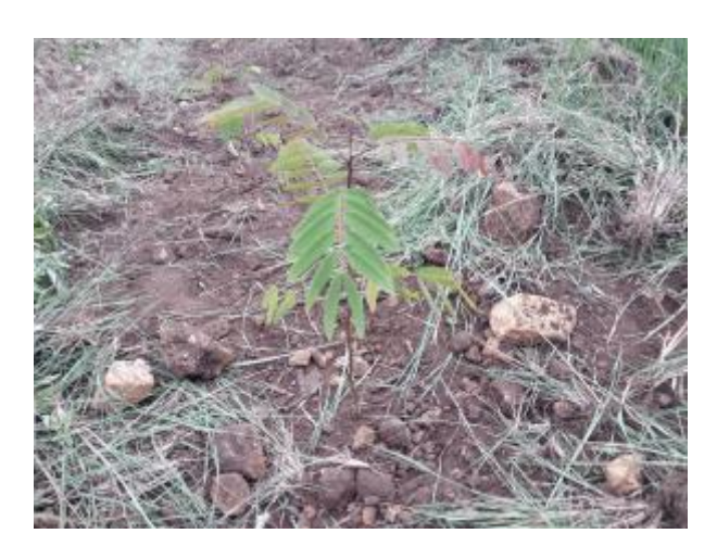
1 - Acacia tree that has been planted