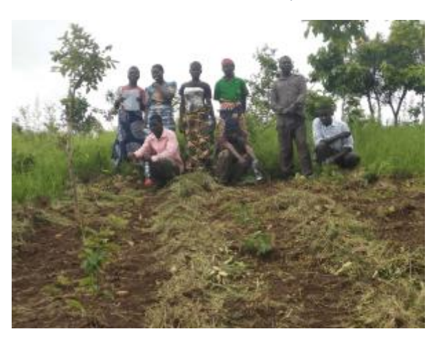
2 - Community members involved in tree planting