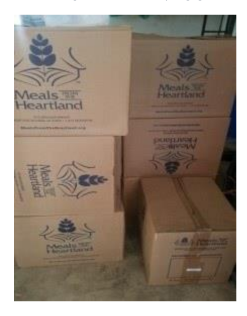
4 - Cartons of relief food