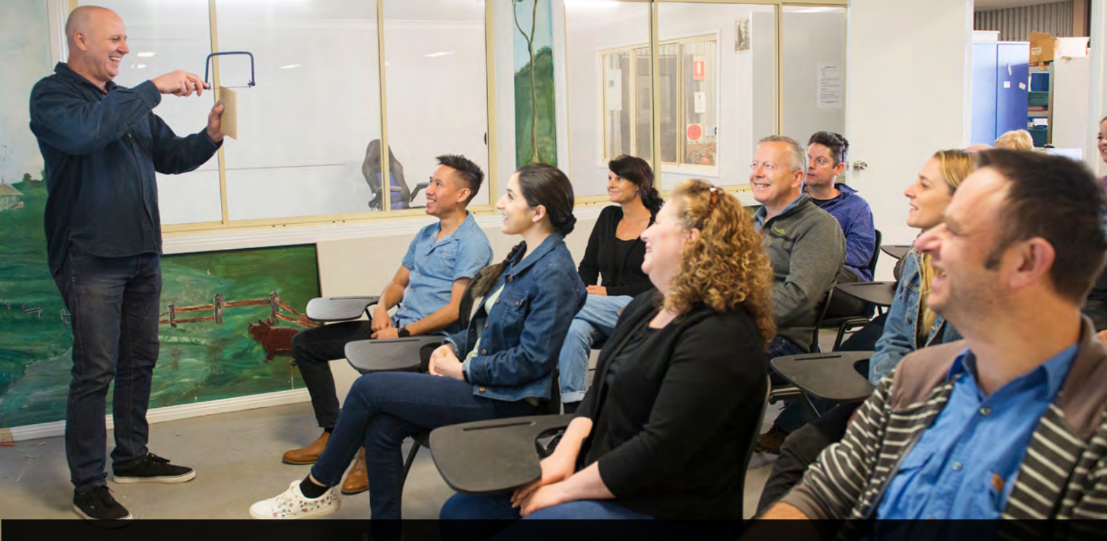
Making classes relaxed and fun helps to engage adult learners who have had bad school experiences in the past.