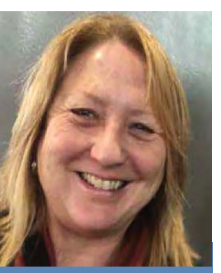
Lifelong learning must be a priority of all levels of government. To that end we will continue to advocate for a national policy to help guide our future steps so that we learn best how to meet the many challenges before us.

Welcome to 2023. I hope you had an opportunity to rest and enjoy time with family and friends over the break.