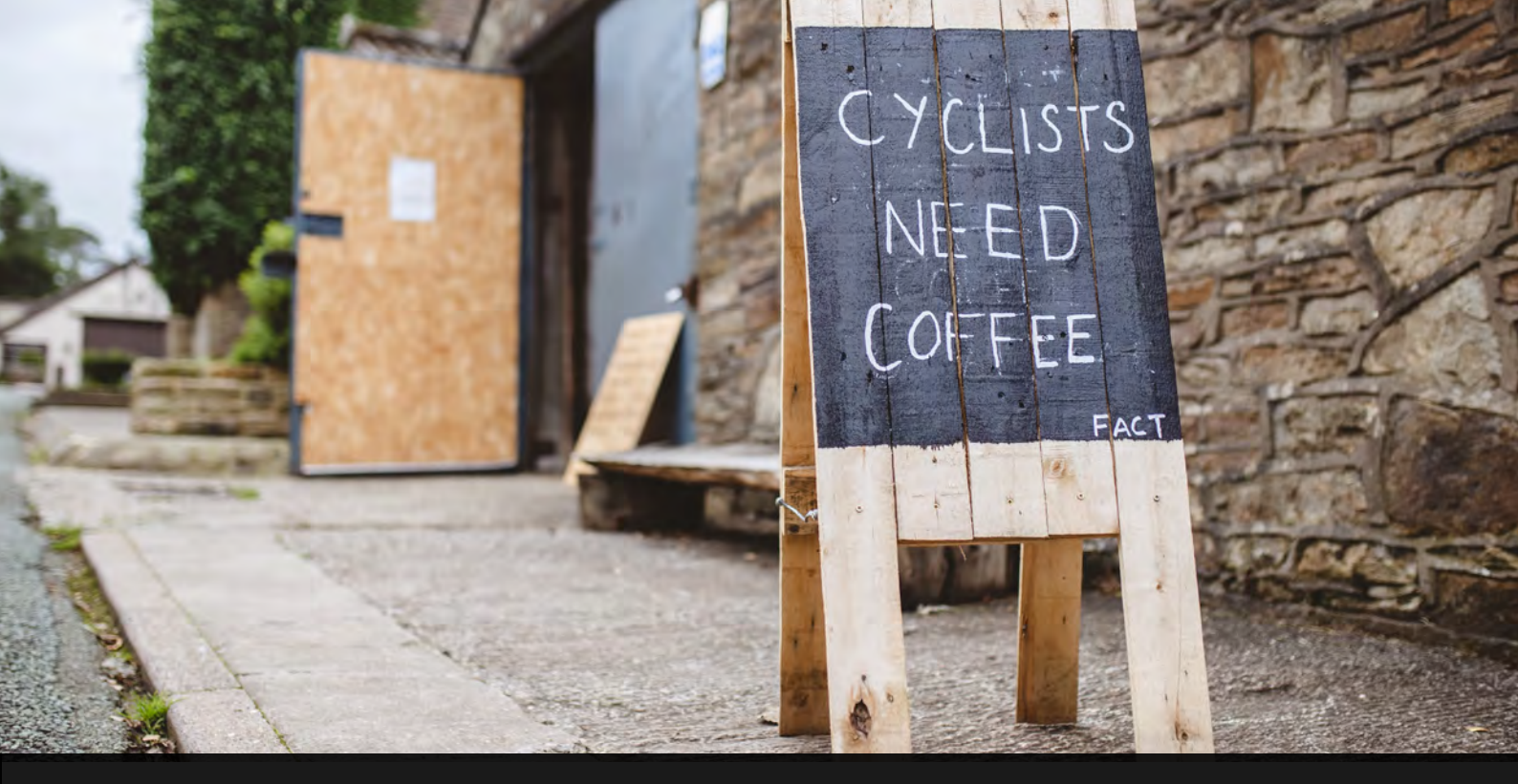
An influx of local and international cyclists to the Yarra Valley will bring new business opportunities.

they're learning. If you don't have any skills coming along to a class it can be quite intimidating. At Lilydale it's more of a classroom setting so while there's no music I use a lot of anecdotes and experiences from my own life. And I keep it as light as possible, particularly if people are worried about making mistakes or asking what they might think are dumb questions. I always say that we're all here to learn.