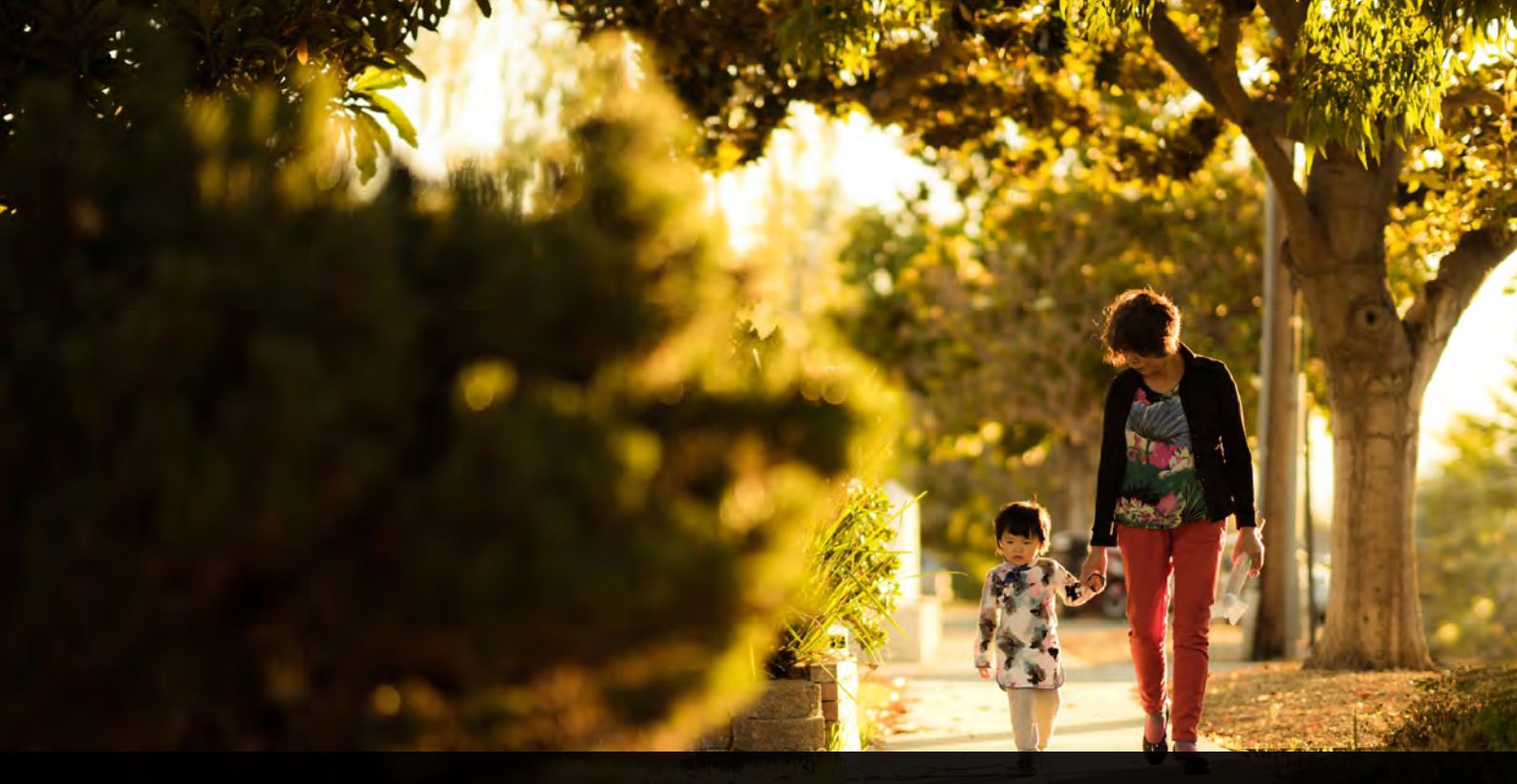
Education helps people at Odyssey House to find a career pathway and rebuild relationships.

say, "The best thing you can do to keep clean is to find an occupation you love and that will give you purpose in life that will make you happy."