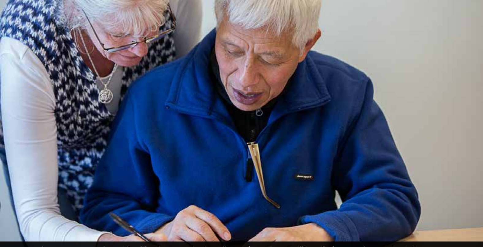
Students at Learn Local providers like Pines Learning in Melbourne's north east will benefit from teacher training in literacy, numeracy and digital skills.

has been terrific. We met five times for Q & A sessions and to share stories and resources as they worked their way through the course.