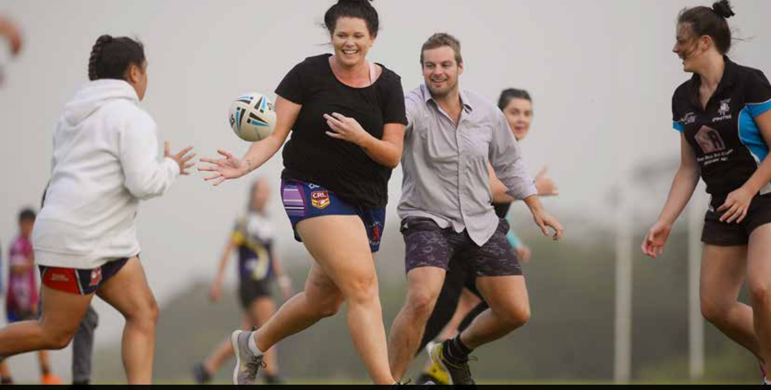
Local newspapers are the lifeblood of communities, sharing information about local sport, cultural events, and supporting local businesses.

to do a puzzle page which includes a Guyra crossword. We expected it to last just a couple of weeks. But it's taken off. People just love it. One woman sends it to her mother up in Queensland and they do it together, another sends it to her niece in America. So people are sharing it online with people who have moved away and they're all engaged in finding out the information together. It's really taken off.'