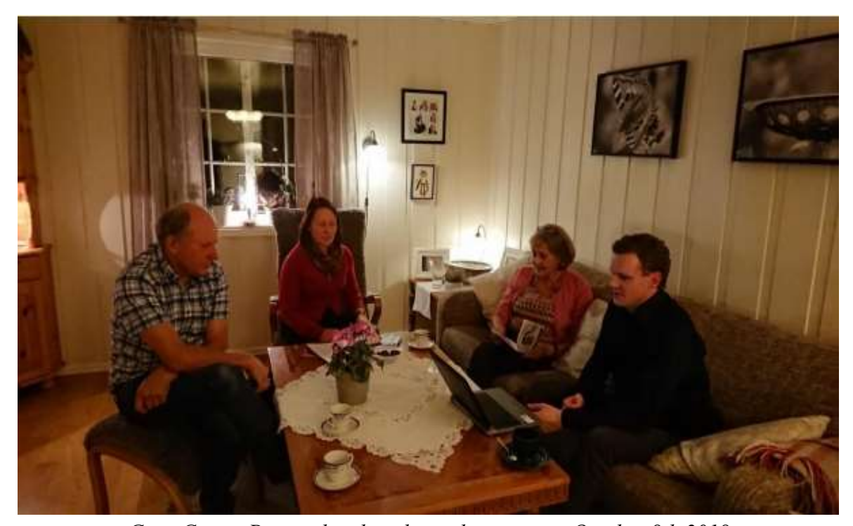
Gran Centre Party – local study circle in action, October 8th 2018

Over some time now, this tendency has been growing not only in social media but also in local debate and even in the local Municipality Council. Questions concerning debate climate and democracy were therefor raised. The members also discussed the possibility that people will avoid local politics, and not choose to stand for local elections because of the harder debate climate.