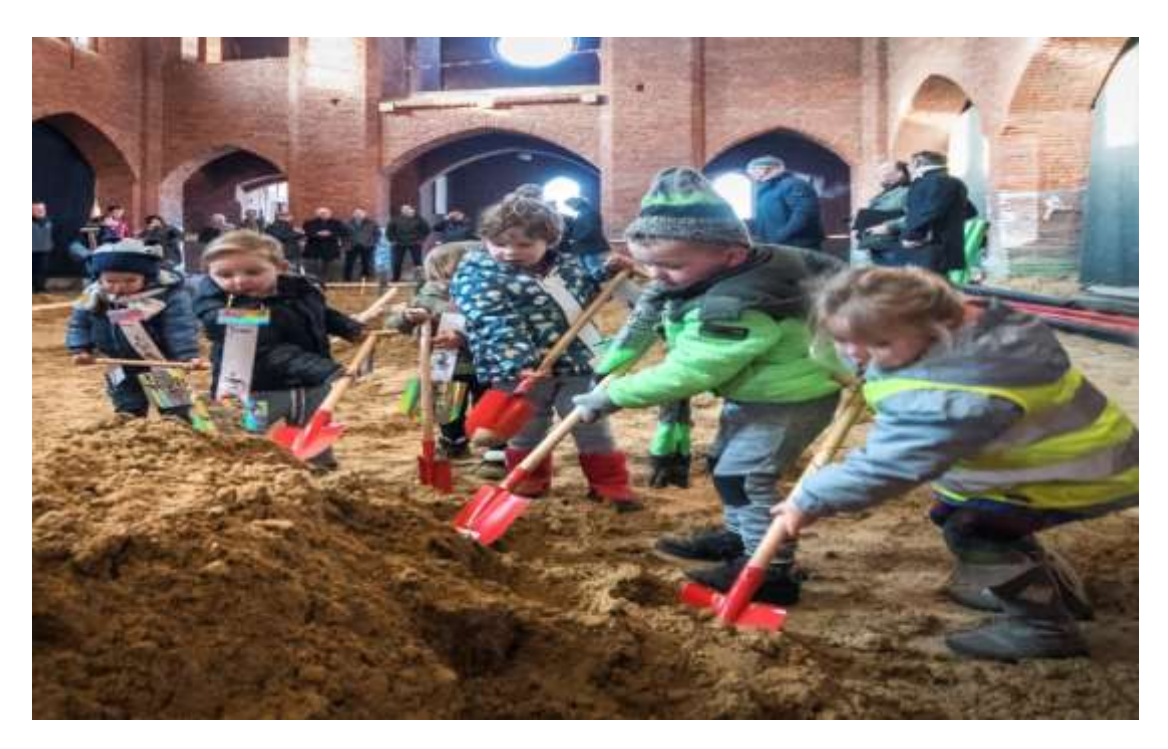
The start by children of the rebuilding of the church into a kindergarten, a day-care centre and a primary school, organised by a special study circle

Also the church in Esbeek languished. A special study circle was created. After seven years, people bought the church and started to build a kindergarten, a day-care centre and a primary school inside the church. In this way the building of the church is kept, which is important for the many elderly in the village, and they are happy with the idea that it will be used for the very young. For this plan the municipal administration will invest about 3 million euro in total.