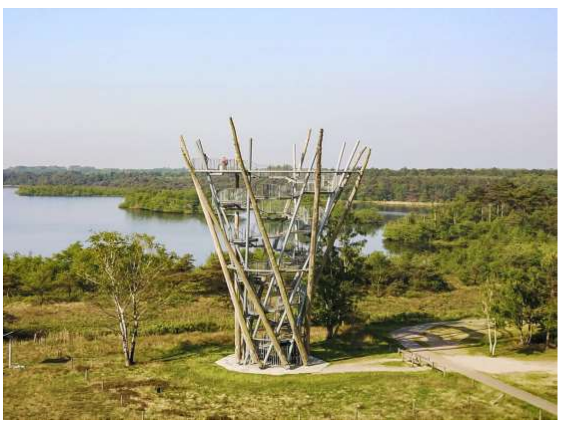
The watchtower, realised by the study circle "Sustainability and nature"

build a 24 meters high watchtower. With the help of amongst others a local steel enterprise, the scouting and the local history study circle, this tower of 55,000 kilo was built. The tower lies on hiking and biking routes and a wheelchair route. For one euro one can enter the tower. The municipal administration only paid the legal and administrative charges.