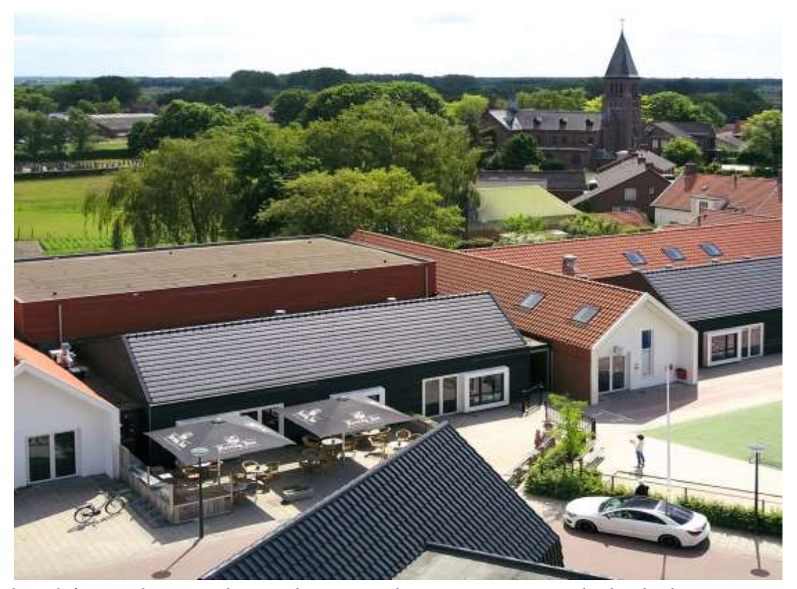
The multifunctional accommodation with a meeting place, a gym, a primary school and a day-care centre in Biest-Houtakker, organised by the study circle "Liveability and Inclusiveness"

Especially for the elderly in the municipality of Hilvarenbeek there are special study circles concerning philosophy, art, literature, music, etc, with no costs for the municipal administration. The investment for the municipal administration concerning the realisation of the ten most important ideas of the study circles in Hilvarenbeek is seven million euros.