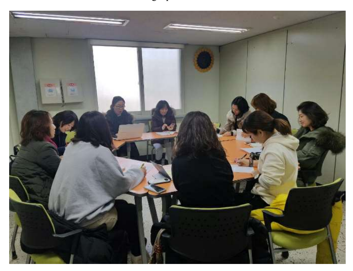
Practice sharing for living together

Through the educational presentations and mentoring, parents not only at Uijeongbu City but also at other cities can transfer their know-how, spread the play-learning culture and contribute to the reduction of private education expenses by providing regular programs for children of dual-income families and single parent families.