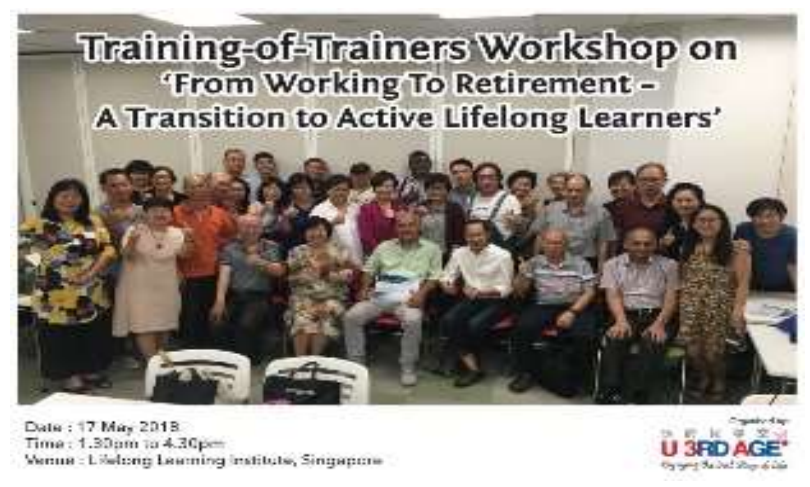
Dr. Poul-Erik giving a 'Training of Trainers Workshop' in 17 May 2018

Community learning starts from the bottom up rather than from the top down. Our learning topics were suggested and curated by seniors themselves instead of people being told what to learn. Active learning from choice generates energy, enthusiasm for life and good interpersonal relations, and makes for positive citizenship and collaboration. Policy-makers should support later life learning as people are living longer and need to find meaningful living.