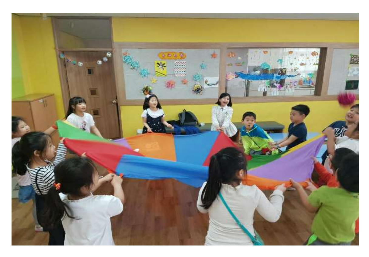
Happiness of Sharing, various social volunteer activities

One of the important shared values of the club is the realization of a vibrant learning community where smiles bloom together with your fellow neighbours. To this end, members provide various volunteer activities for the local community, including cooking services, ecolearning instruction, child care, history and culture, and the experience of guidance for those who are considered to be multicultural, disabled, single, or elderly people living alone and in orphanages.