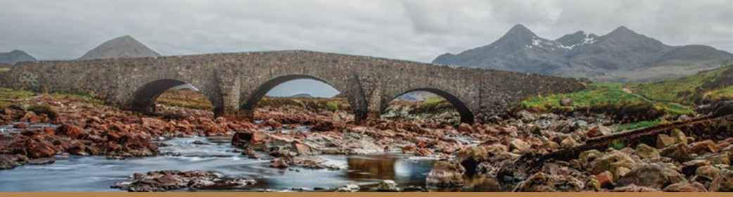
BOOK YOUR TICKETS HERE: newbattleabbeycollege.eventbrite.co.uk

And 2019 began with the release of the first single from Karine Polwart's Scottish Songbook, a re-imagining of some of Karine's favourite classic Scottish pop songs. Each month will see a new single, culminating in a full album release in the summer and a tour of prestigious venues in the autumn, including Edinburgh's Usher Hall.